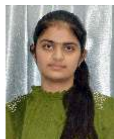
Kriti BSc-BEd-I Sem 1 95.60% 1 st