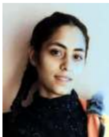
Diya BA-I Sem 1 87.00 % 1 st