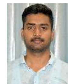
Uday BSc-I (NM) Sem 1 92.92% 1 st