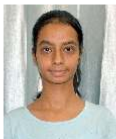
Yashika BA-BEd-I Sem 1 91.50% 1 st