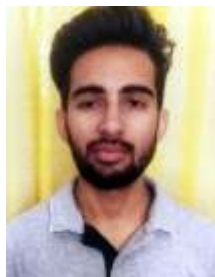
Sunny BA-I Sem 1 83.50% 2 nd