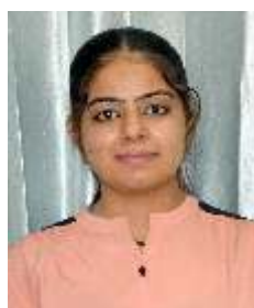
Perna BCA-II Sem 3 94.13% 1 st