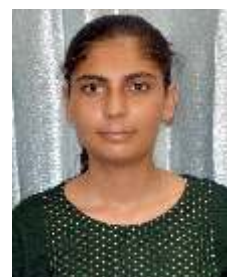
Noor BA-BEd-I Sem 1 91.38% 2 nd