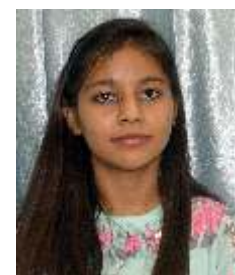
Dhriti BSc-I (NM) Sem 1 92.92% 1 st