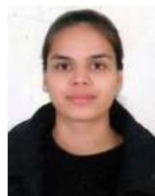
Varinda M.Com.-I (AF) Sem 1 91.33% 1 st