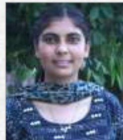
Noor B.A B.Ed. -III 1st