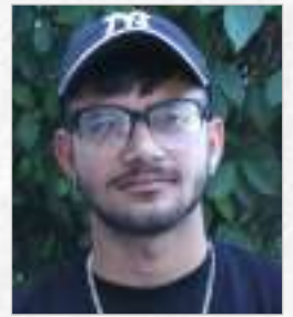
Madhav B.Voc.(SD)-II 2nd