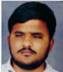
Goldy B.A -III 3rd