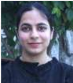
Diksha B.A -III 2nd