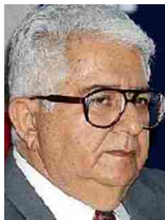
Justice M.M. Punchhi Former Chief Justice Supreme Court of India.