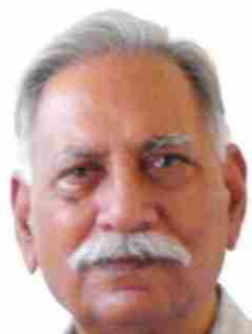
Gen. Faiz Ali Chisti Former Chief of Army Staff, Pakistan Army.