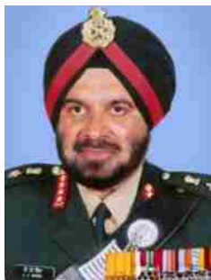
Gen. J.J. Singh Governor, Arunachal Pradesh & Former Chief of Army Staff, Indian Army