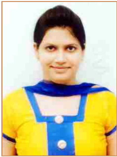
Konica M.Com.I 1st 503/700